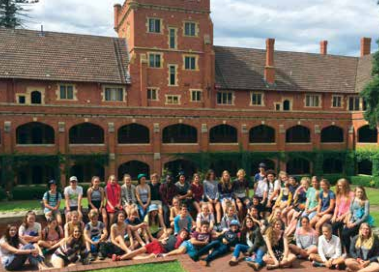
ST GEORGE'S COLLEGE